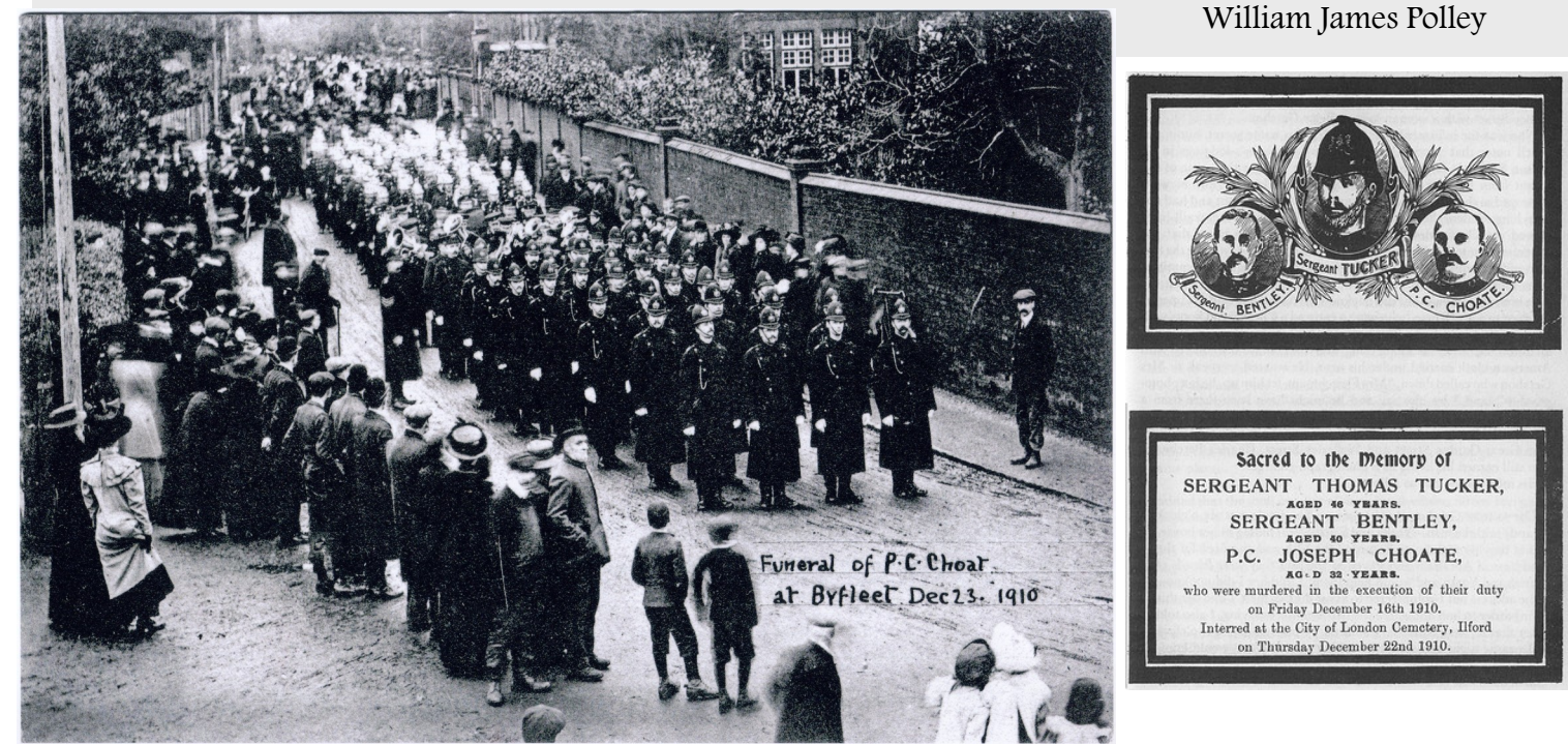
Byfleet Heritage Society, Byfleet Library, High Road, Byfleet, Surrey KT14 7QN Published by: Tessa Westlake, 8 Brewery Lane, Byfleet, Surrey KT14 7PQ